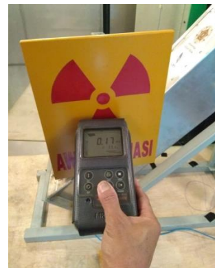
Figure. 3. Radiation Sign and radiation measurement

Regarding personnel safety, one of the management and monitoring actions taken is the use of TLD and the dosimeter, which is applicable to the principle of radiation protection. This is capable of reducing the risk of the body receiving radioactive exposure by