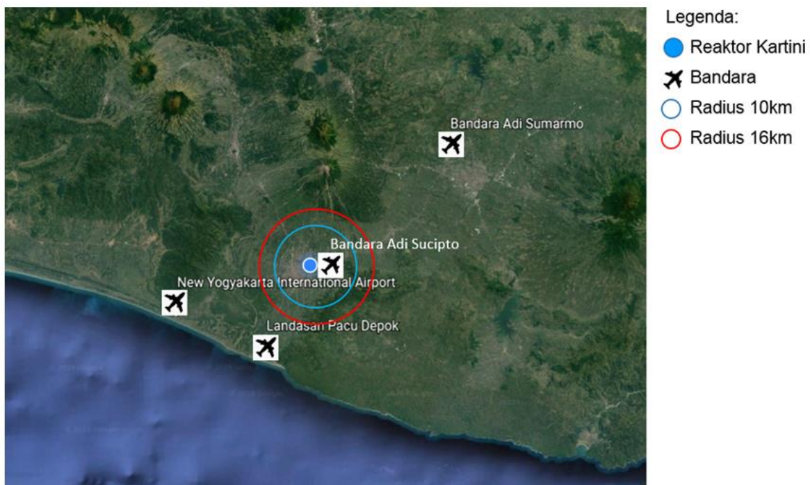
Figure 2. Map of Airport Locations Around the Kartini Reactor site

Mapping existing airports around the Kartini Reactor site based on the identification result is shown in Fig. 2.