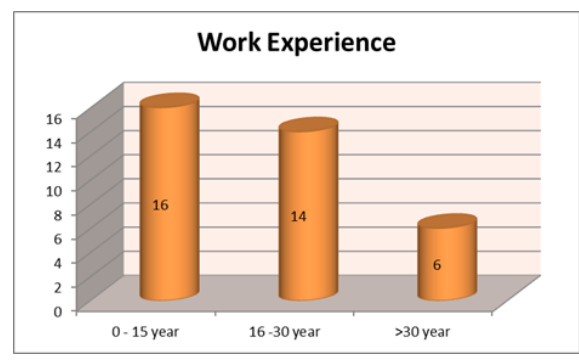
Figure 1. Respondents data tabulation related with working experiences.

according to their experience on influence the leadership and commitment to rework level in construction project.